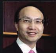
NATURAL TALENT CLUB