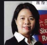
INTL 6 SIGMA COUNCIL