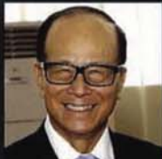
LI KA SHING