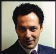
I.G.I. HONG KONG