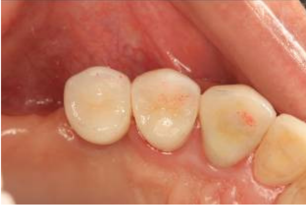
Figure 4: Intra-oral photography showing the occlusal view of the definitive prosthetic rehabilitation in position #25.