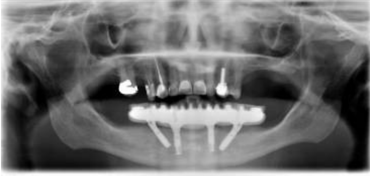
Figure 1: Pre-operative orthopantomography showing absence of teeth #25.