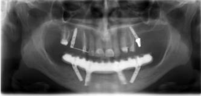
Figure 6: Orthopantomography with definitive rehabilitation with 1-year of follow-up.