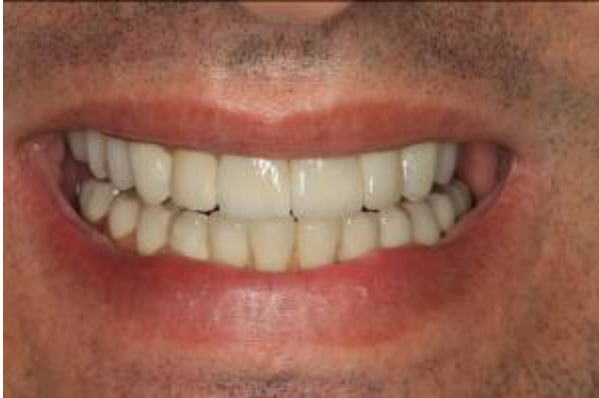
Figure 5: Patient smiling with definitive rehabilitation.