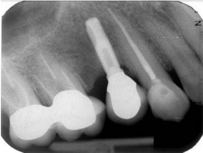
Figure 11: Representative radiograph of a narrow diameter implant with 10 years of follow-up.