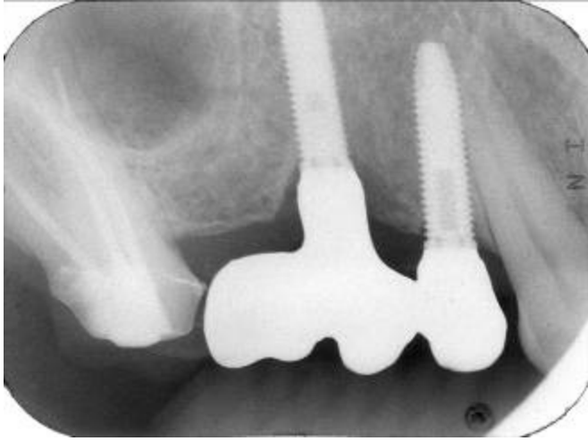
Figure 9: Representative radiograph of a narrow diameter implant with 1 year of follow-up.