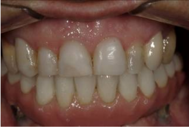
Figure 2: Pre-operative intra-oral photography.