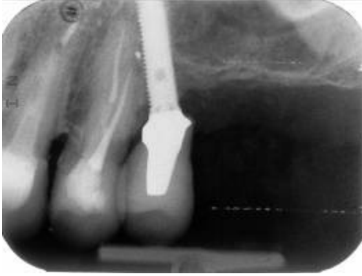
Figure 7: Periapical radiograph showing 3 years of follow-up for implant #25.