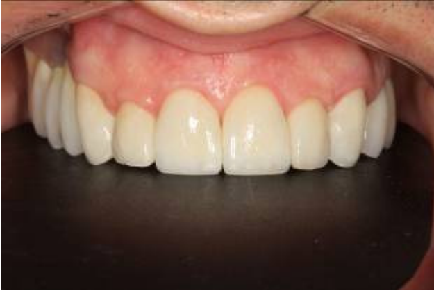
Figure 3: Intra-oral photography with definitive rehabilitation completed.